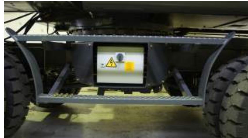
Lockable master switch