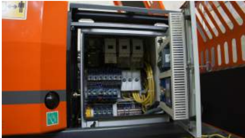
Control cabinet for E-drive