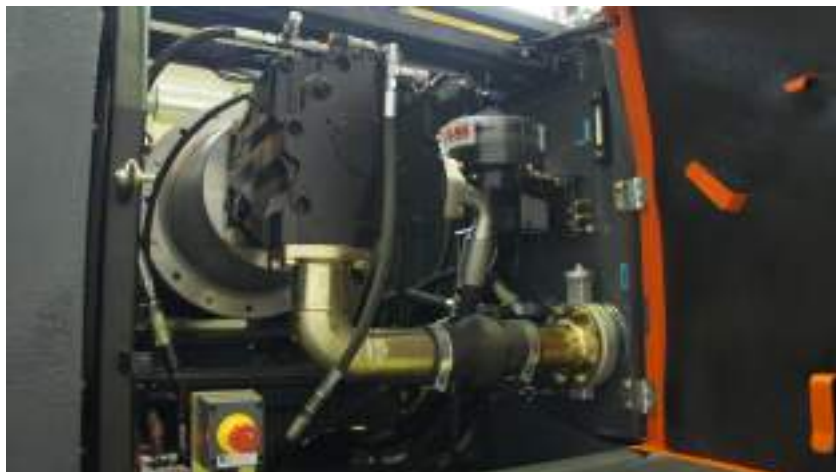
Main pump and lockable suction flange