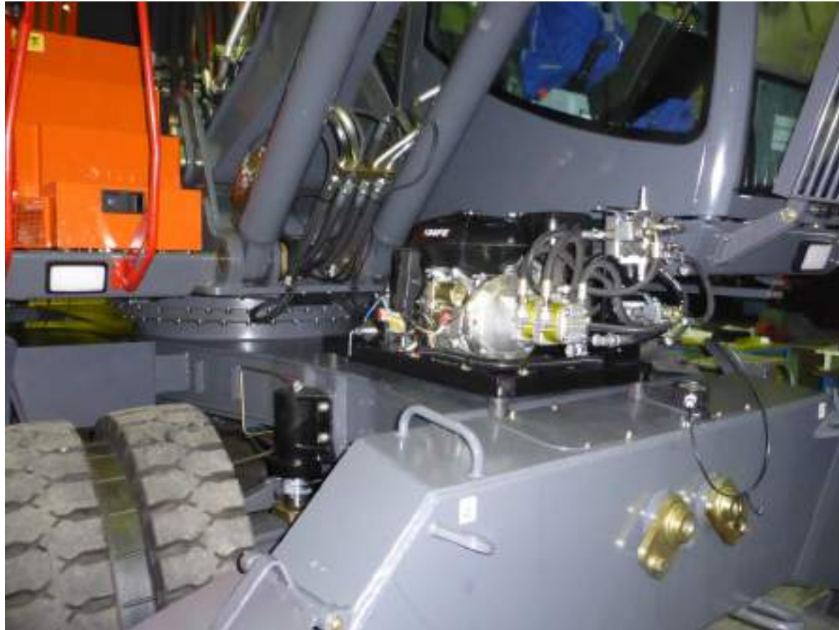
Emergency unit for moving the machine (gasoline powered) (optional)