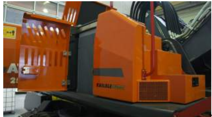
Side panel and radiator